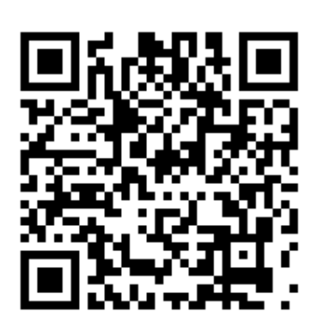
See what life is like for ELA students

The English Language Academy (ELA) is part of the University of Auckland and is located on the university's city campus in Auckland. The ELA provides a wide range of high-quality English language courses for international students. Courses include direct-entry pathway programmes for students who are interested in pursuing undergraduate and postgraduate degrees at the University of Auckland, as well as specialist English language teacher training courses and general English courses. The ELA is an accredited IELTS and PTE Academic test centre, as well as a Cambridge TKT and CELTA training centre. The ELA has agreed to observe and be bound by the New Zealand Government's Code of Practice for the Care of International Students.